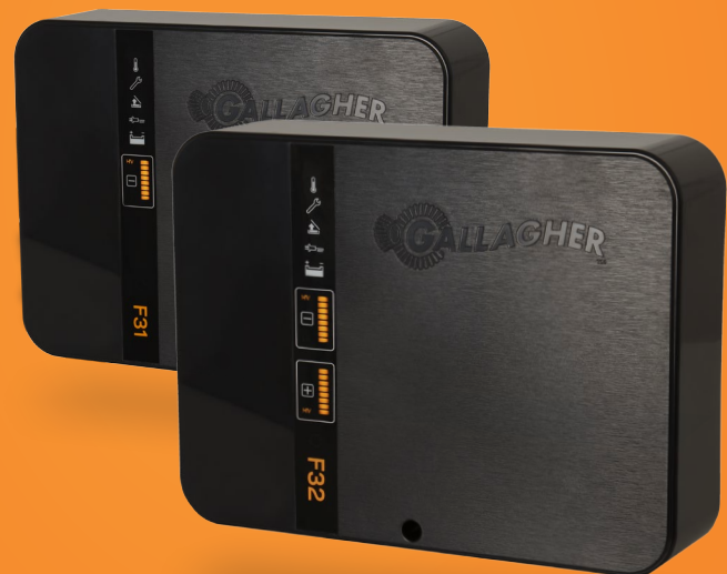
F32 Fence Controller G21940 - Dual Circuit